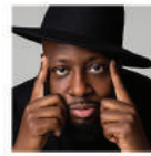
Wyclef Jean Acclaimed Artist & Producer Elevate Main Stage