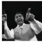
Javier Hasbun Venture Capital and Weething