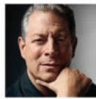
Al Gore Chairman, Generation Investment Management Elevate Main Stage