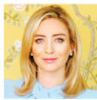
Whitney Wolfe Herd Bumble Elevate Main Stage